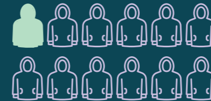
1 in 12 live with mental ill-health