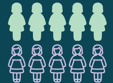
Half identify as female