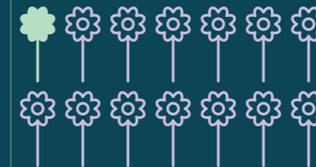
1 in 14 experience homelessness