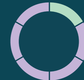
1 in 6 are mature age 2